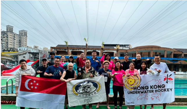
Seeding UWH in a new region - Taiwan 🇹🇼