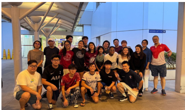
Setting off from Harbourfront again...this time we're off to compete against the best in the region @ Asian Junior Cup 🍀