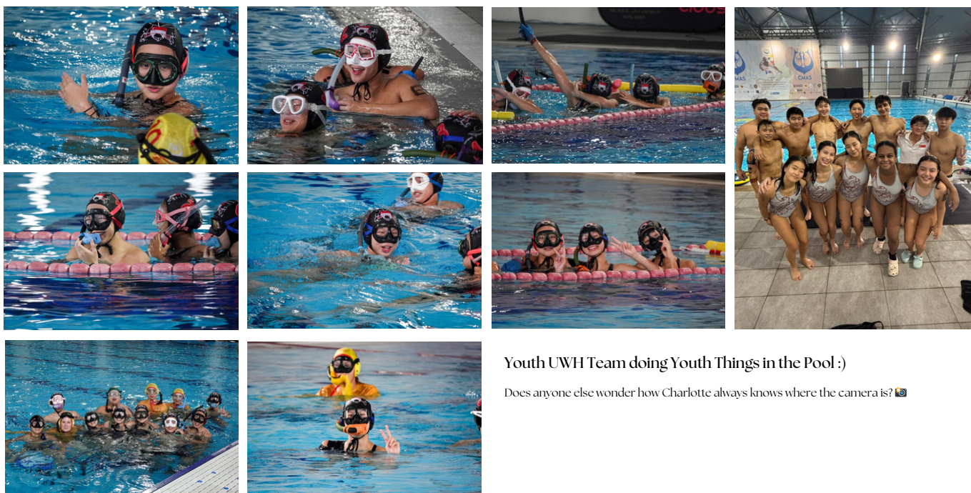
Youth UWH Team doing Youth Things in the Pool :)