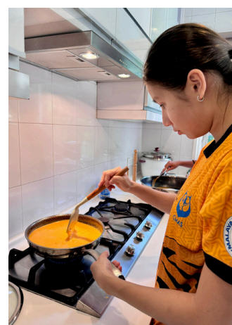
Team Prep for Breakfast... Thankfully no leftover banana concoctions were conjured up during this process 😊