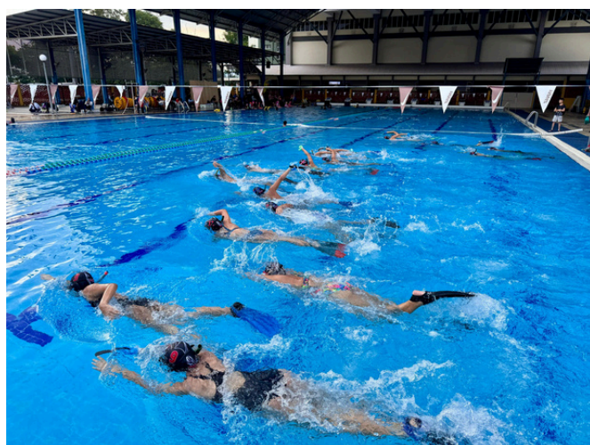
UWH Youth Team working hard in the Tunku Abdul Rahman University of Management and Technology Swimming Pool