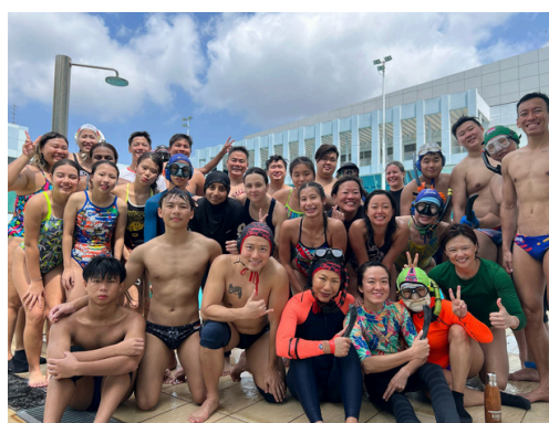
Some ❤️ the sun...some not so much; But all ❤️ UWH!