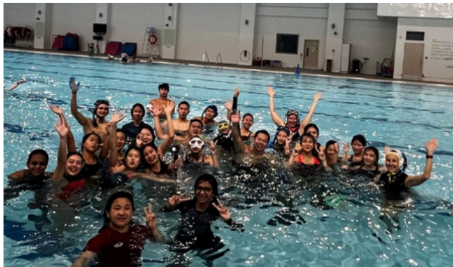
1v1 Competition - Great for practising those stick skills!

As part of our holistic UWH Youth Program, 2025 was split into three Training Blocks: Block 1: Individual skills work; Block 2: Working in 2s and 3s; Block 3: Working as a team of 6 (Competition Format).