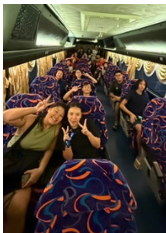
Team Bonding on the UWH Bus

This Training Camp served to reinforce concepts taught throughout the April Training Camp, and of course, many occasions for team bonding: On the team bus, wolfing down yong tau foo, cooking, cleaning and most importantly playing UWH!