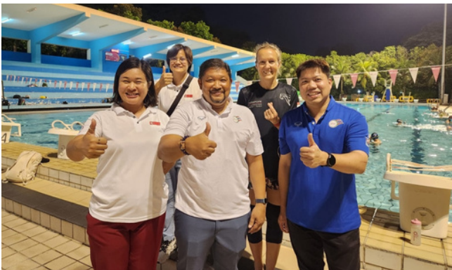
Thailand 🇹🇮 UWH reps paying us a visit - Sharing best practices!