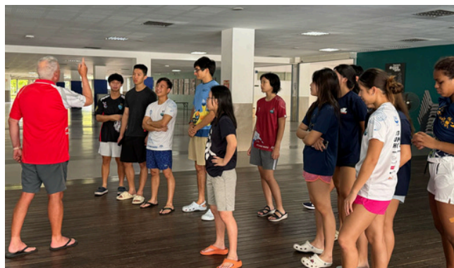
'The first thing to do in the morning is ... Play UWH!'