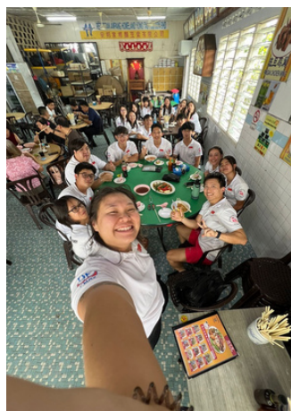
Team Bonding over Ampang Yong Tau Foo