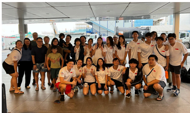
Setting off on our 2 nd Trip to KL for UWH Training Camp

As the June school holidays rolled around, our Youth Athletes were raring to go for our Mid-Year Overseas Training Camp.