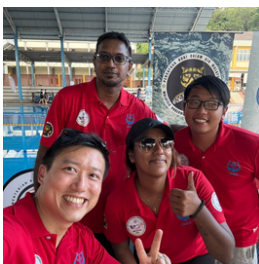
Referee duties at the Malaysian 🇲🇾 UWH Nationals - Forging closer connections with our UWH friends up north!