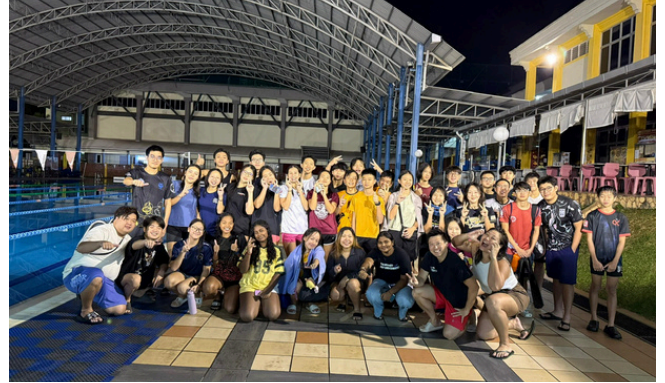
Singapore & Malaysia Youth Teams 🥰 #WeAreUnderwaterHockey!